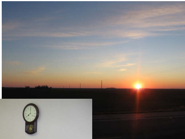
Garden City Sunset